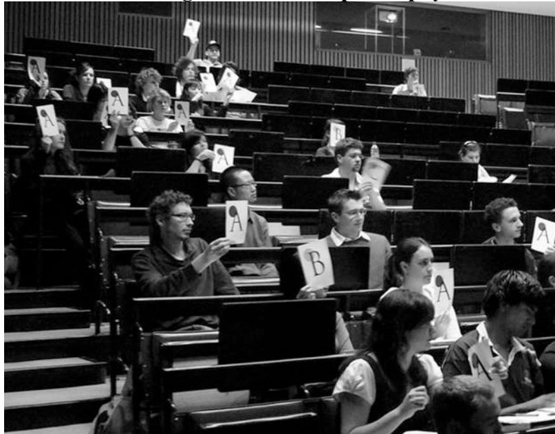
Students using flashcards in a philosophy lecture